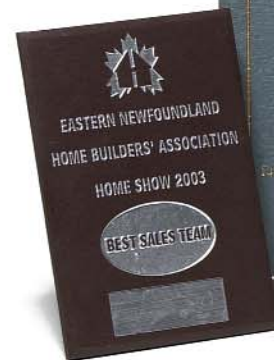
725 - 5" x 7" in Burgundy