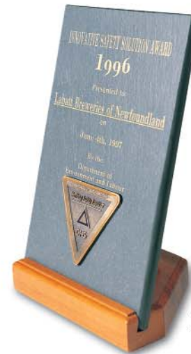
Custom Plaque designs are available.

Available in either Burgundy, Green or Black slate colors with endless options for customization including color infill.