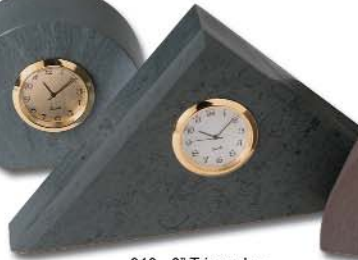
313 - 6" Triangular