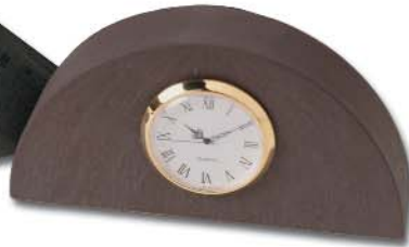
310 - 6" Semicircle