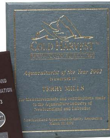
723 - 8" x 10" in Green