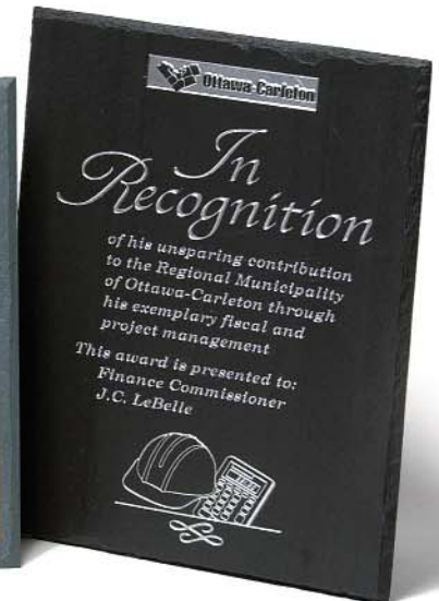
722 - 9" x 11" in Black